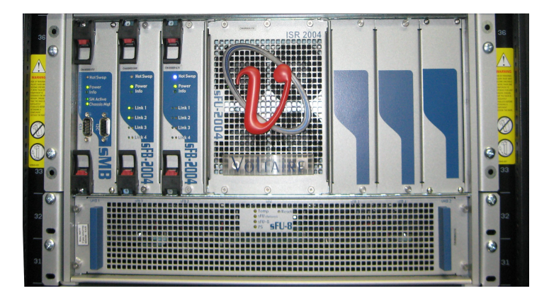
Figure 5. - Voltaire Grid director 2004 Infiniband switch.

that applications do not run into network bottlenecks even when the cluster is fully used. The core switch of the Infiniband interconnection is a Voltaire Grid director 2004 Infiniband switch (Fig.4). This main advantage of Infiniband versus Ethernet consists in the low-latency of point-to-point communication, where the latency is measured at 2.5 \,\mu s between each two nodes.