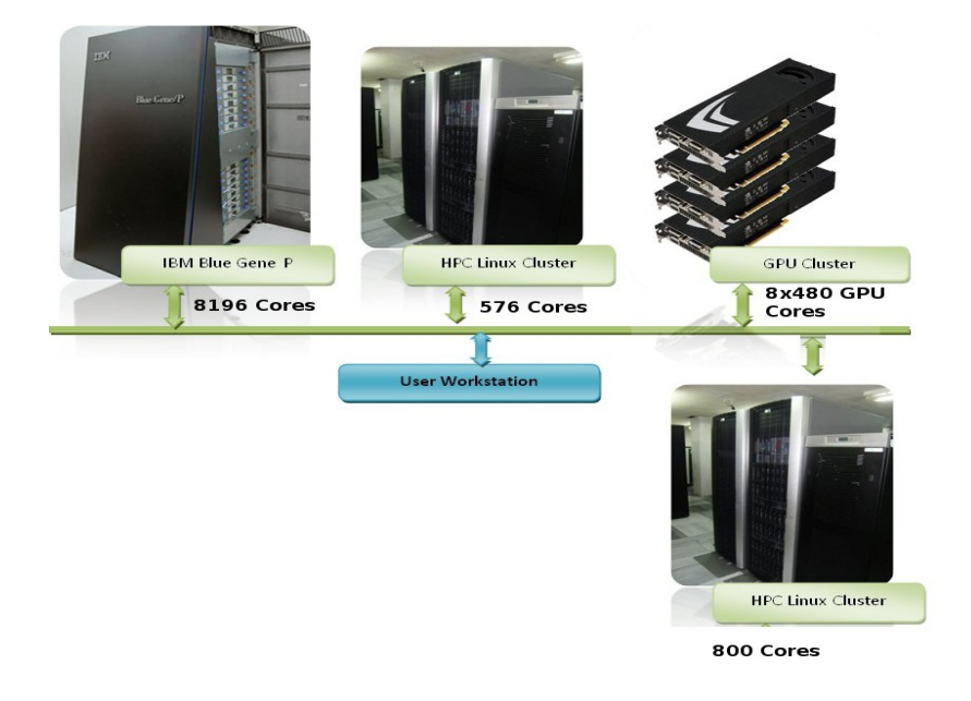
Figure 1. - The Bulgarian HPC infrastructure.

two big HPC clusters with Intel GPUs and Infiniband interconnection at IICT-BAS and Institute of Organic Chemistry with Centre of Phytochemistry approximately 1400 cores total. In addition GPU-enabled servers equipped with state of the art Nvidia GPU cards are available for applications that can take advantage of them.