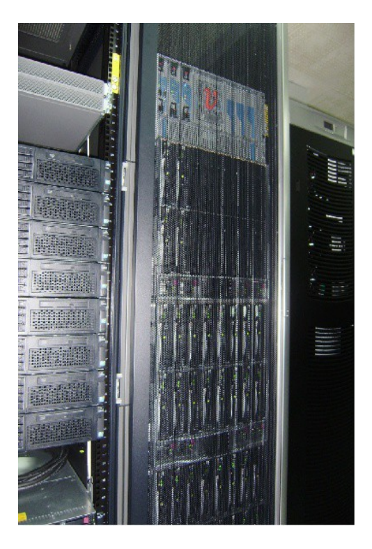
Figure 2. - HPC Cluster at IICT-BAS.