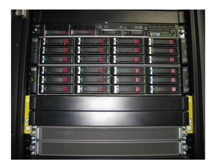
Figure 3. - Cluster Storage Area.